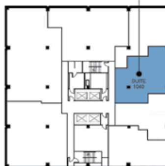
10TH FLOOR KEY PLAN